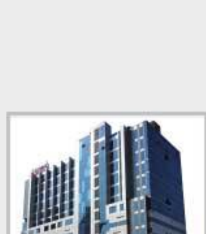
Global Hospitals, Mumbai