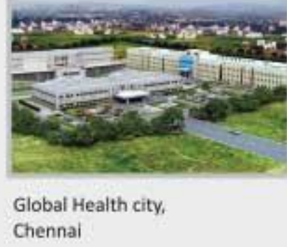
Global Health city, Chennai