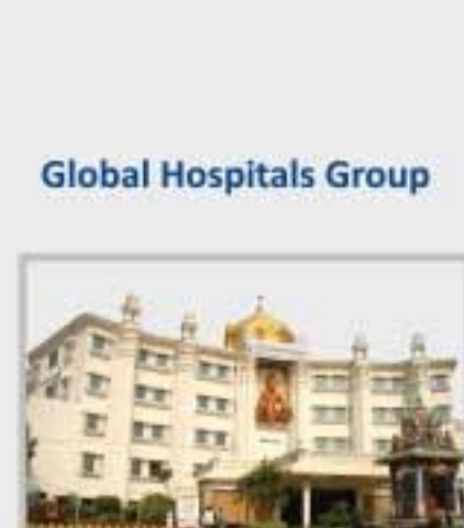
Global Hospitals, L.B. Nagar, Hyderabad