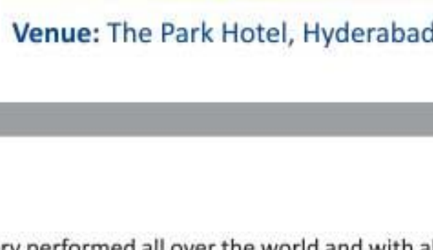
Venue: The Park Hotel, Hyderabad

Hernia surgery is the most common surgery performed all over the world and with all the recent knowledge, scientific and technological advances, we can change our way and approach to a Hernia surgery. Keeping this in mind we proudly welcome you to an update on Hernia where we will exclusively discuss inguinal and ventral hernia over a concise duration of two days. There will be discussion about both open and laparoscopic operative techniques in the esteemed presence of the national faculty. We aspire to give our delegates a feast of knowledge and hope that you would give us a chance to play the perfect host. Looking forward for your presence at Hyderabad.