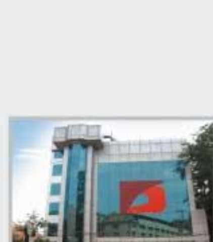
Global Hospitals, Lakdi-ka-pul, Hyderabad