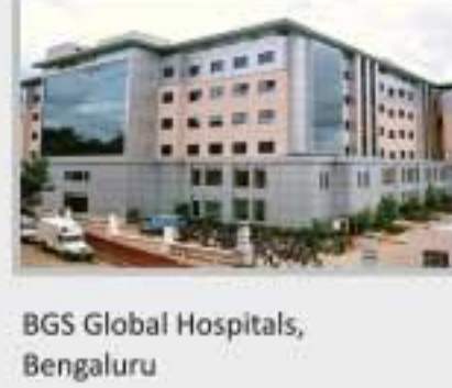
BGS Global Hospitals, Bengaluru